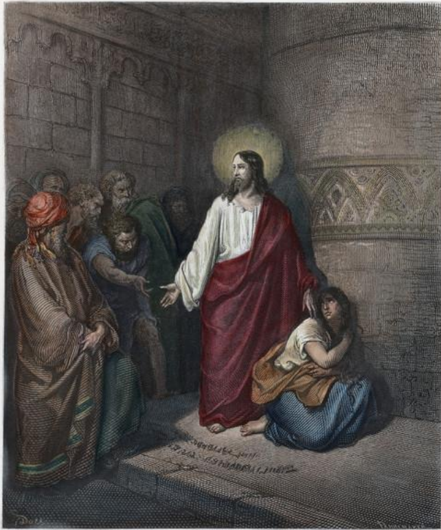
JESUS AND THE WOMAN TAKEN IN ADULTERY Jesus stooped down, and with his finger wrote on the ground... and said unto them, He that is without sin among you, let him first cast a stone at her.... (John 8:6, 7)

from what we as Christians know revelation to be, we should expect for their conclusions about what constitutes an “inalienable right” to be different from our own. How do we know what our inalienable rights are as creatures? We know them from the Bible, the Word of our Creator which directly tells us who we are, how we should live, and what His purpose for our lives is. On that note, the question of whether or not freedom of speech is a God-given right is still a difficult one.