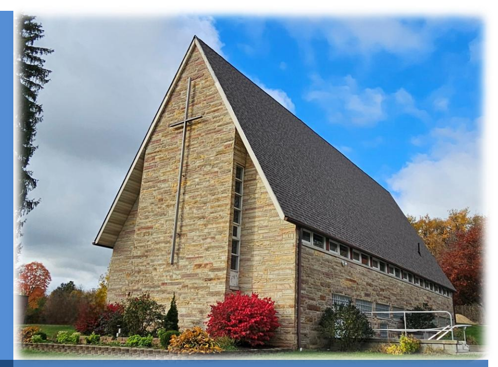
Christ's Messenger The Heart of Christ, in the Midst of Greater Mantua"